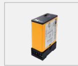
BRD05 EWI Loop Detector