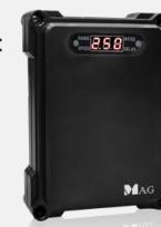
BRD03 DualRay and LED Display