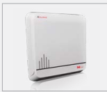
AR300U Xclone Long Range Reader