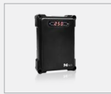
BRD03 Traffic Detector