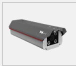
SNP131 License Plate Recognition