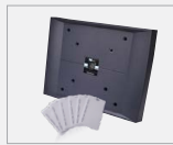
AR200U Mid Range Reader