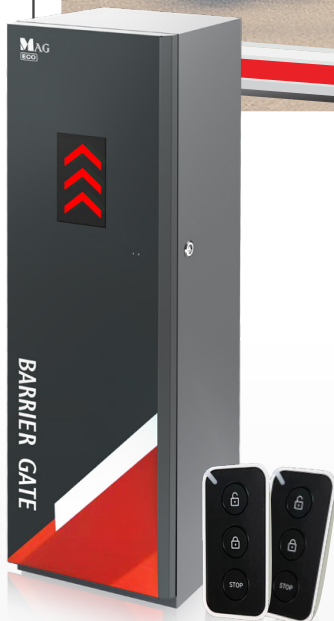
BG856 Eco Series

MAG latest technology innovation of RedSpeed motor empower a new generation of spring-free barrier gate that greatly enhance mechanical performance while keeping it very affordable. Minimalist slimer profile design makes your guard house look instantly stylish.