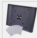
Mid range reader