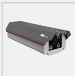
License plate recognition camera