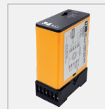
EWI loop detector