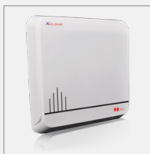
Xclone long range reader