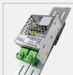
Xclone 12V power supply